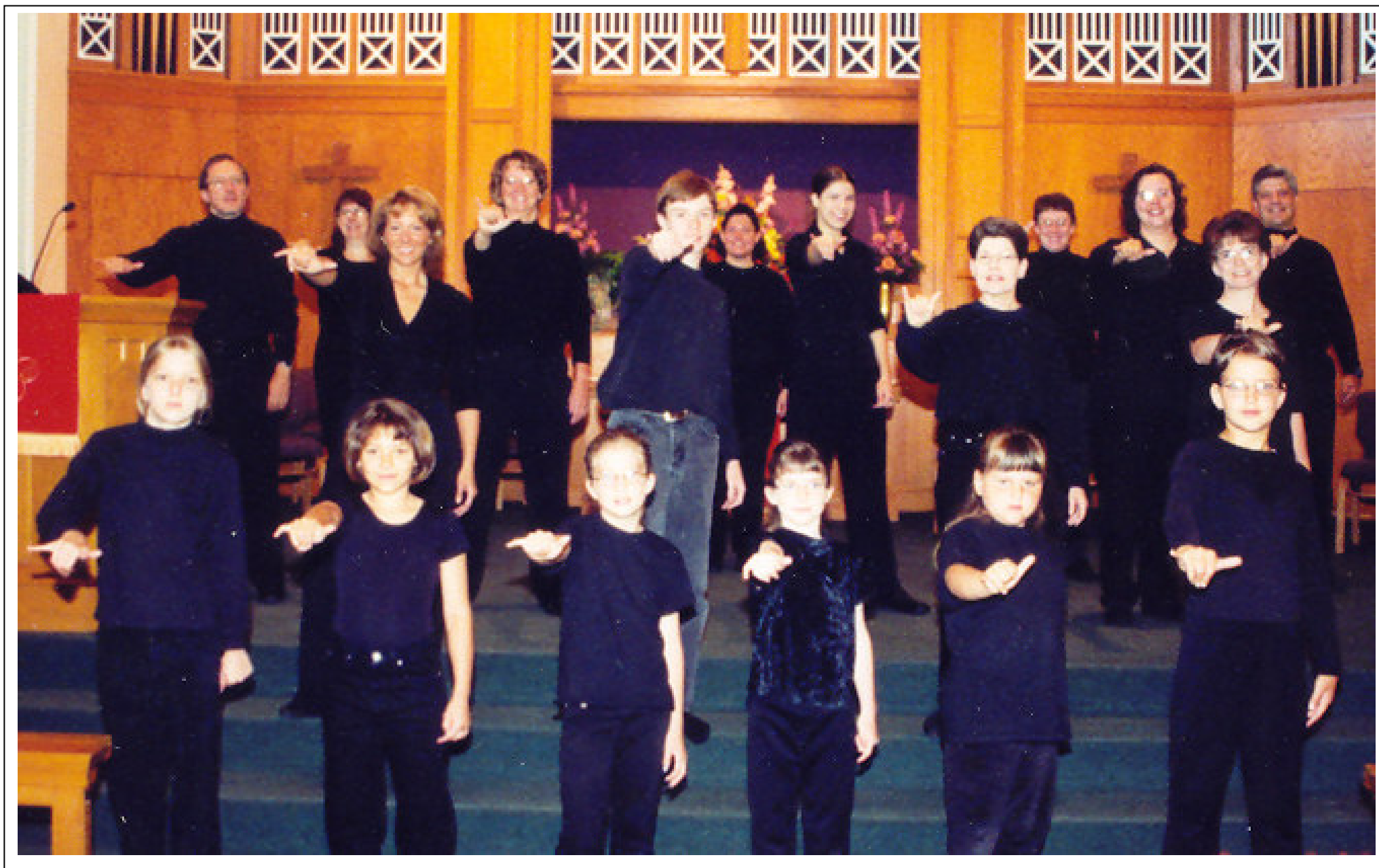
“Hands of Glory” performing in the Chancel for a Sunday Service