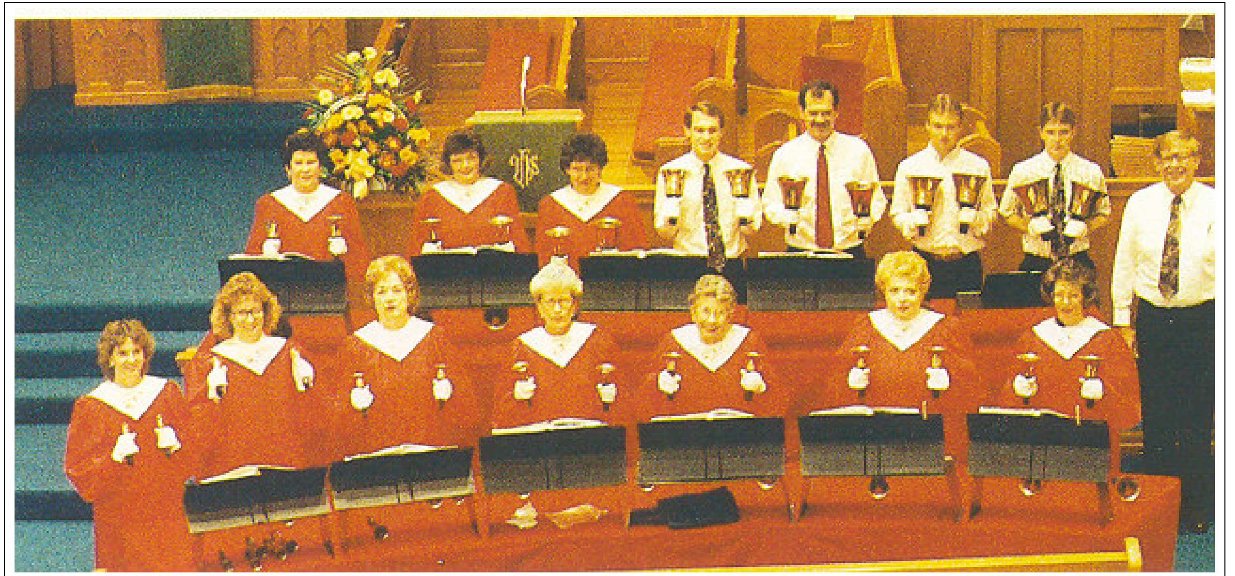
The Festival Ringers in 1993.