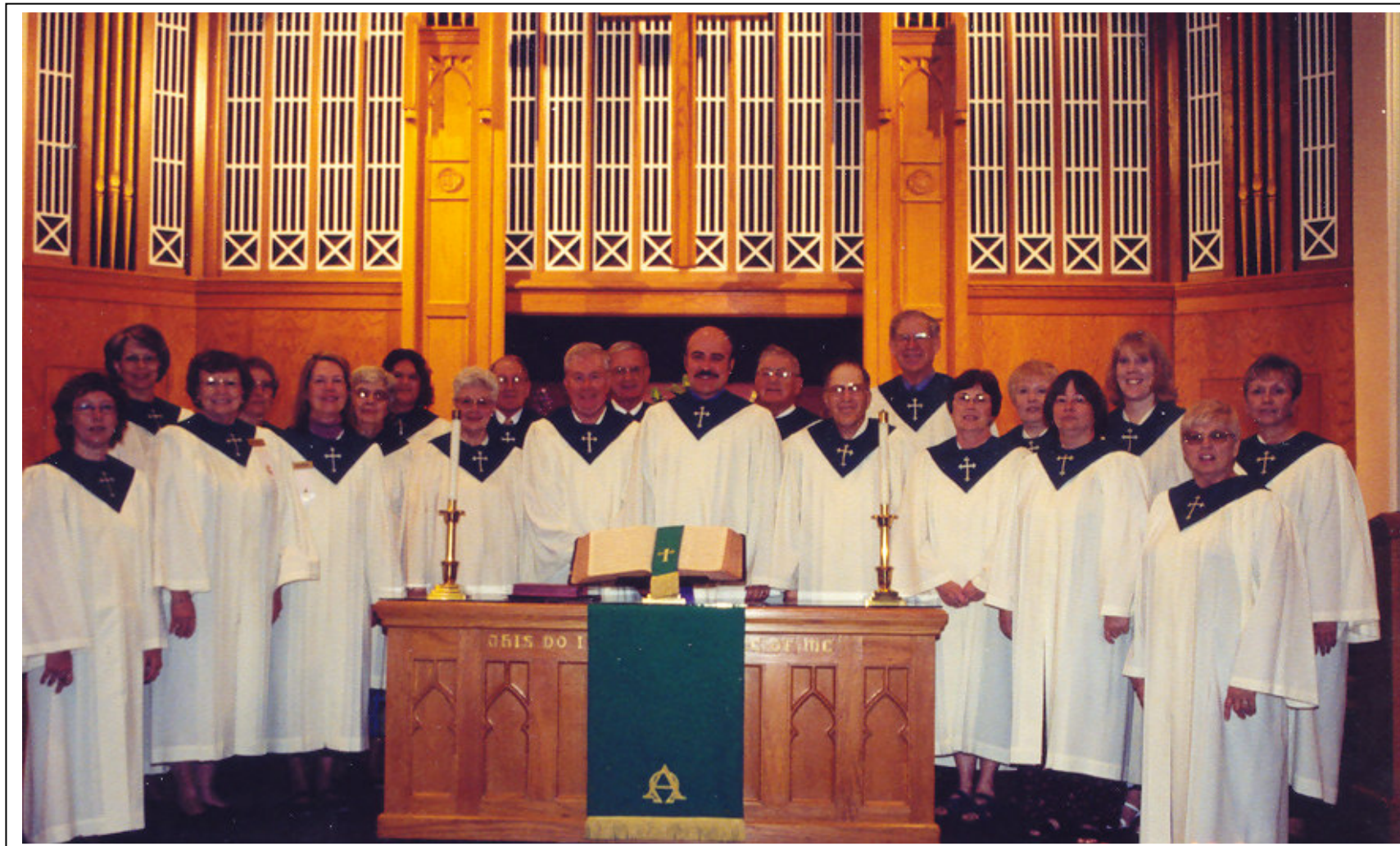
The Chancel Choir in the 1990s