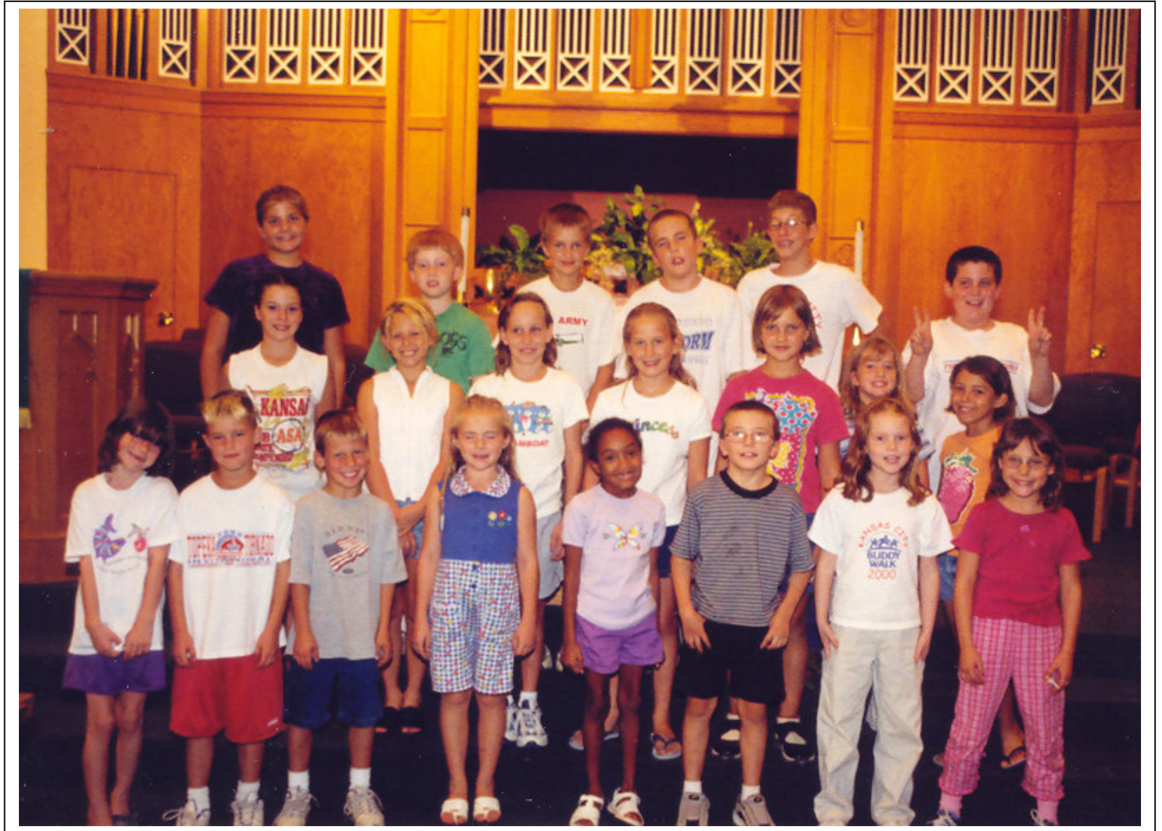
The Junior Choir a few years ago.