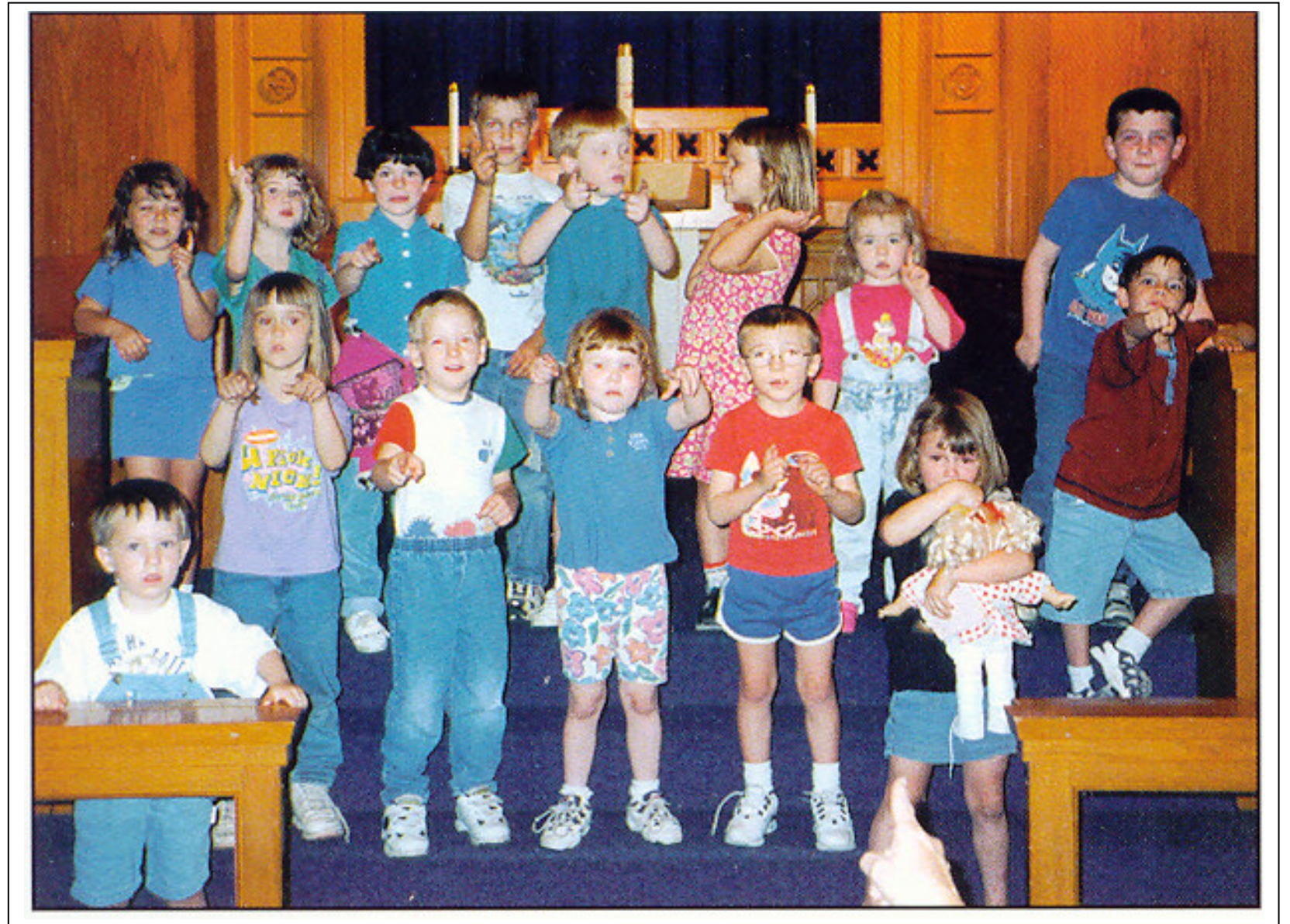
The Cherub Choir, ages one thru six.